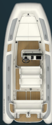
D I E S E L JET — 565 — 9 PERSONS