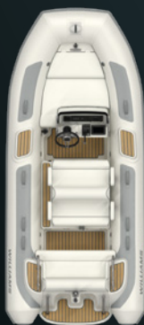
D I E S E L JET — 445 — 7 PERSONS