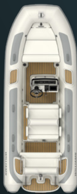
D I E S E L JET — 505 — 8 PERSONS