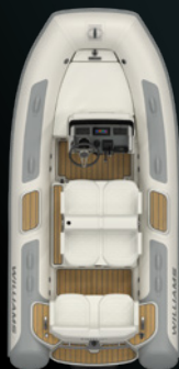
D I E S E L JET — 415 — 6 PERSONS