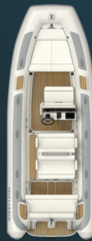
D I E S E L JET — 625 — 11 PERSONS